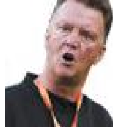
Louis Van Gaal